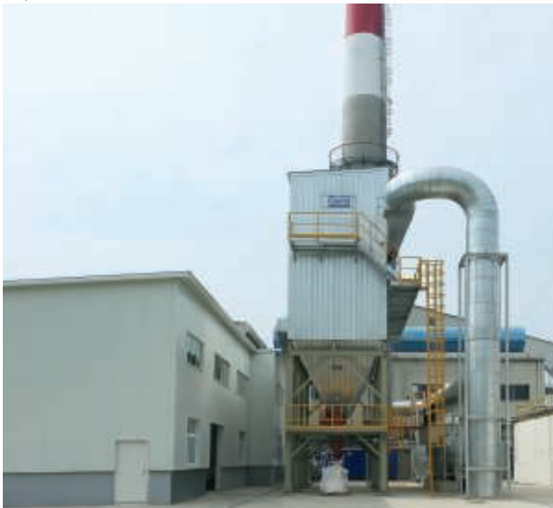
FIGURE 4. Shown here is a catalytic hot-gas filtration system installed in the glass industry by Dürr

are very robust and that they provide readings that are 100% reliable without the additional costs. We also like to remind people who are arguing safety and reliability that traditional instruments drip, plug and fail, but a virtual instrument never has these issues.”