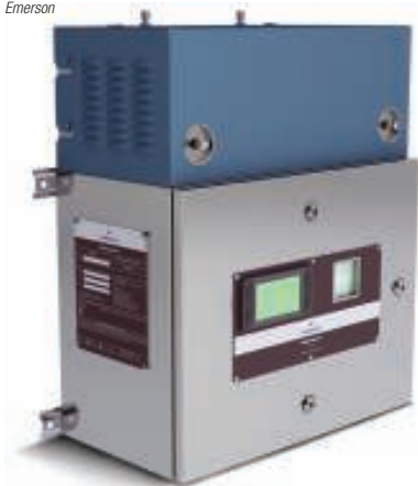
FIGURE 2. The Rosemount CT5100 continuous gas analyzer is a Quantum Cascade Laser (QCL) for process gas analysis and emissions monitoring

out of line, users can be alerted that the instrument needs some attention before the data become skewed and before the instrument is out of compliance.”